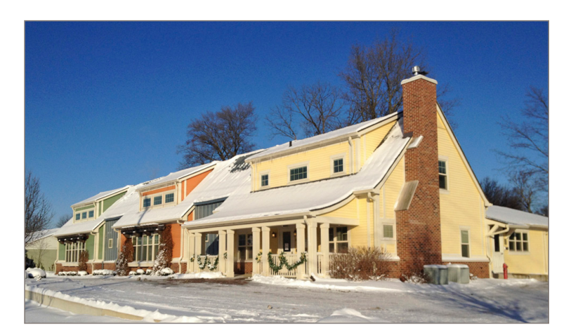
Joy's House Broad Ripple